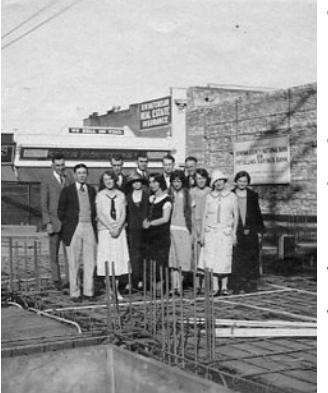
Sonoma County National Bank under Construction, 1925

So, there you have it. 1926, a year in major transition. Wild fun. Great business. Super